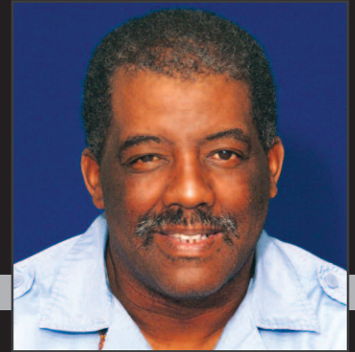
BY ALVIN WILLIAMS

the downward plunge of its popularity and the desire of the people to rid themselves of this government.